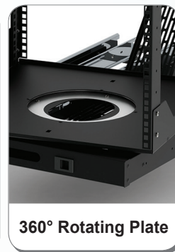
360° Rotating Plate