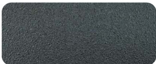
Pearl texture super fine