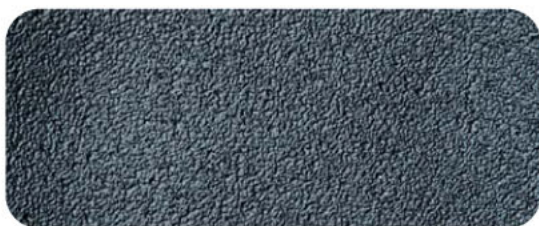
Orange peel texture fine