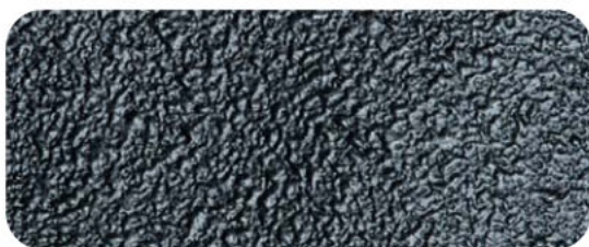
Orange peel texture coarse