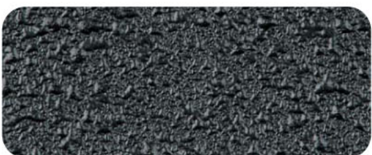
Pearl texture super coarse