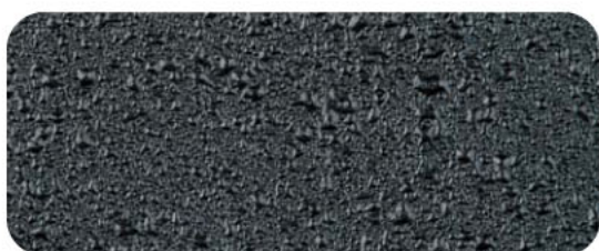
Pearl texture coarse