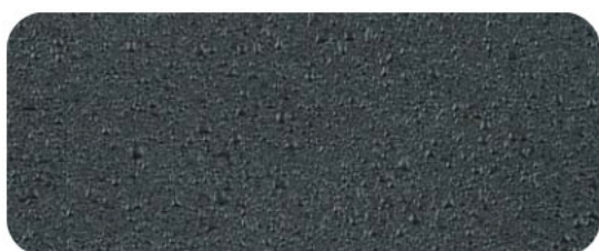
Pearl texture fine